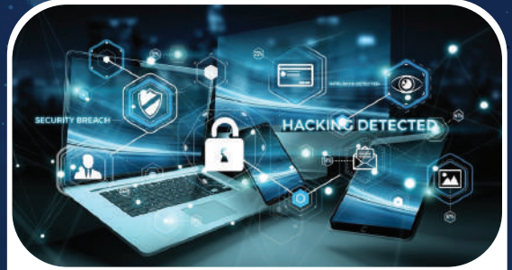
End Point Detection and Responses