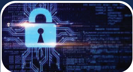
Data Protection and recovery