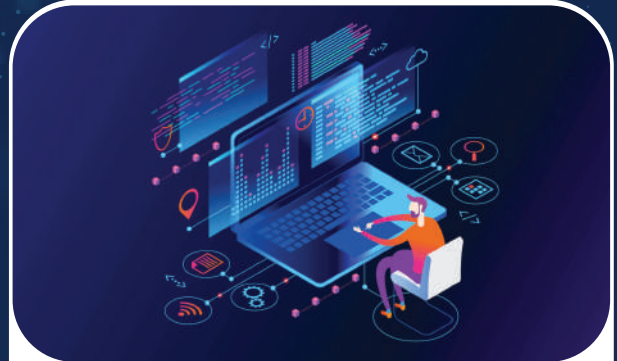
Web Application Penetration Testing Services