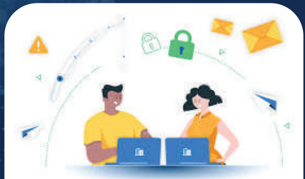
Social Engineering penetration testing Services