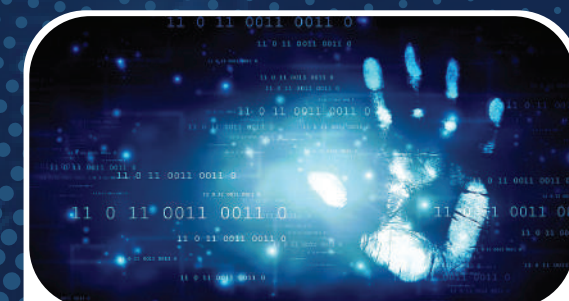
Cyber Crime and Forensic Operations