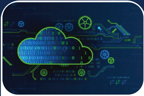
Cloud Security Auditing

QSS comprehensive audits analyze policies, procedures, and technical controls, providing actionable recommendations to strengthen your security framework. It is a critical process that evaluates an organization's information systems and security measures to identify vulnerabilities and compliance gaps. By ensuring adherence to industry standards and best practices, we help organizations enhance their risk management strategies and safeguard sensitive data against potential threats.