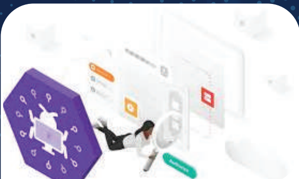
Physical Penetration testing Services