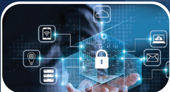
Managed Application Security