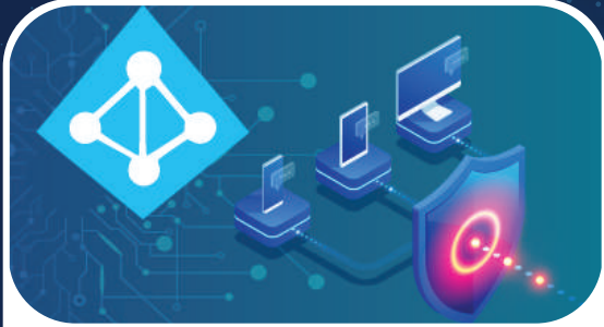
Active Directory Security

At QSS our Team Focuses on enhancing your organization's cybersecurity defenses through proactive monitoring, threat detection, and incident response. Our skilled analysts work tirelessly to safeguard your systems, implementing best practices and advanced technologies to protect against evolving threats. By fostering a culture of security awareness and resilience, we ensure your business can effectively mitigate risks and respond to incidents swiftly, maintaining the integrity of your operations.