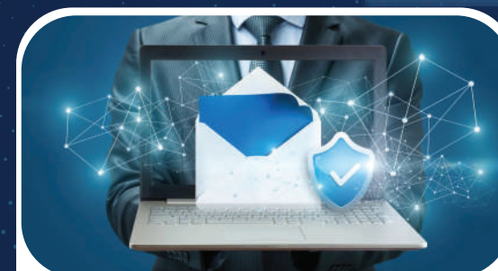
Managed E-mail Security