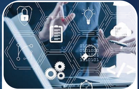
Security Risk Assessment