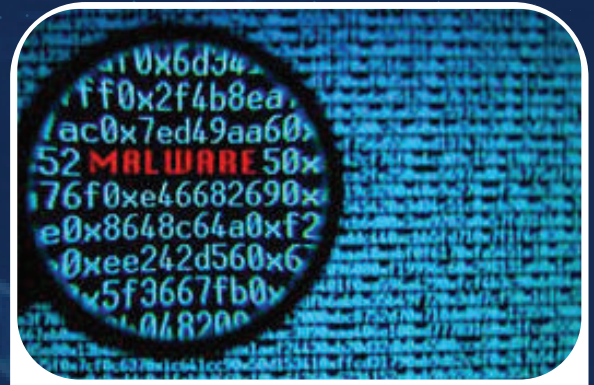
Malware Assessment Auditing