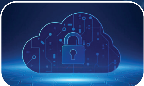
Cloud Security Penetration Testing Services